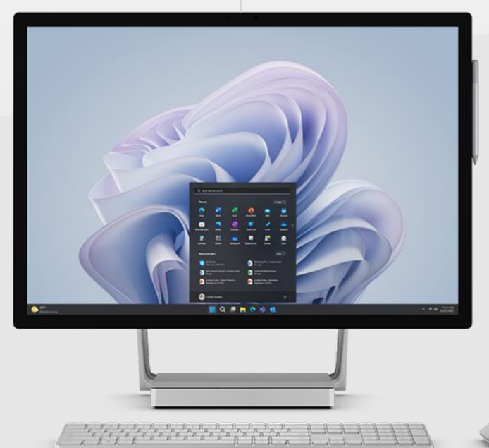
Strikingly large 28" PixelSense™ touchscreen